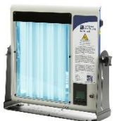
Handisol Small Panel